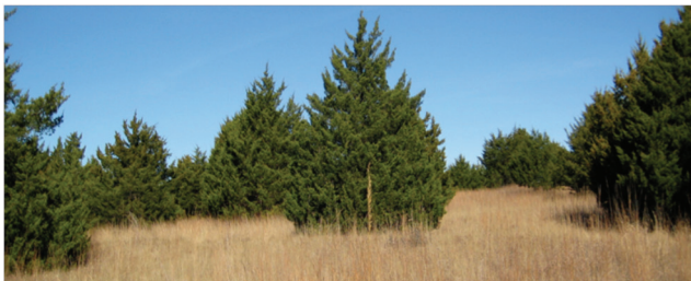
Figure 1. Encroachment of redcedar in a mesic grassland at OSU's Cross Timber Experimental Range near Stillwater.

Water enters watersheds as precipitation, primarily rainfall in Oklahoma. A portion of the precipitation is captured by the vegetative canopy (redcedar or grass) and the litter layer and evaporates back into the atmosphere. The evaporative loss of water from the vegetative canopy or litter is called interception. The remaining water will either infiltrate into the soil or produce