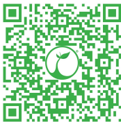
Cover Crop Program